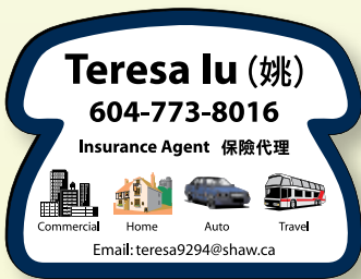
SD 77-4CP 1.94" x 2.56"