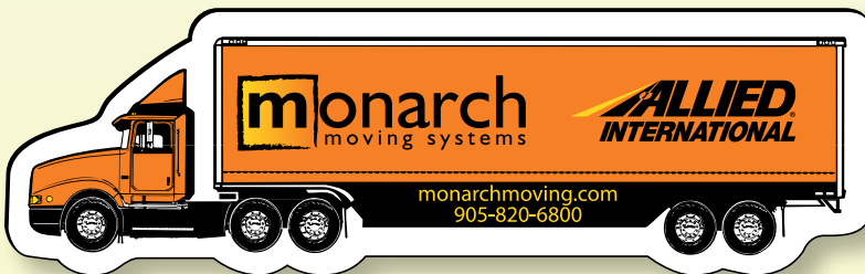
SD 36-4CP 1.25" x 4.12" Shown actual size