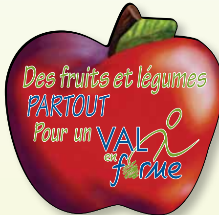
SD 74-4CP 2.25" x 2.31" Shown actual size