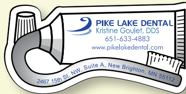
SD 23-4CP 1.5" x 3"