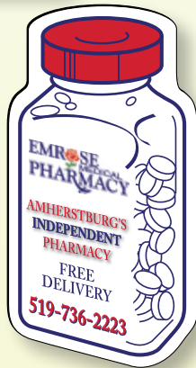
SD 25-4CP 1.66" x 3.13"