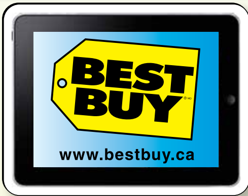
SD 19-4CP 2" x 2.5" Shown actual size