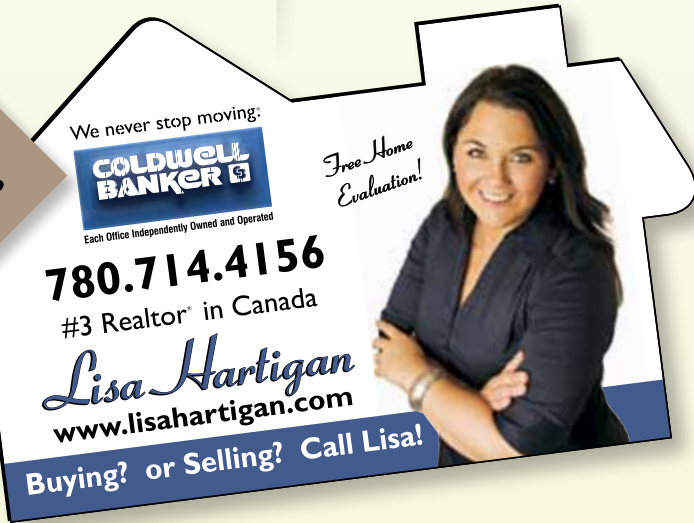
SD52-4CP 2.5" x 4" Shown actual size