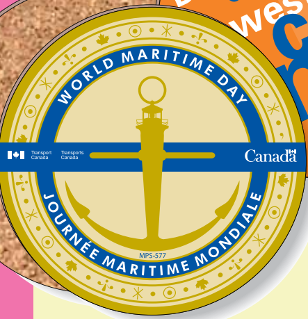
PC1-4CP 3.5" dia.