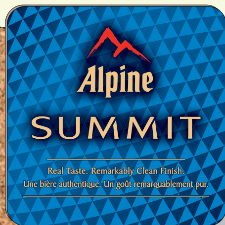
PC2-4CP 3.5" x 3.5"