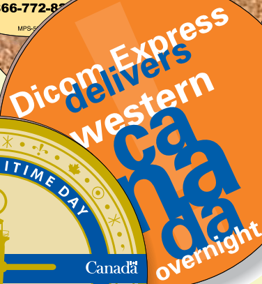
PC1 3.5" dia.